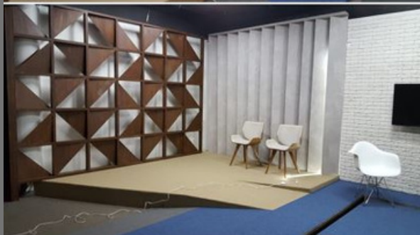
ASSEMBLY SCENARIO OF THE UFG MUNDO PROGRAM - PROOF OF THE LALUCE DESIGN PROCESS