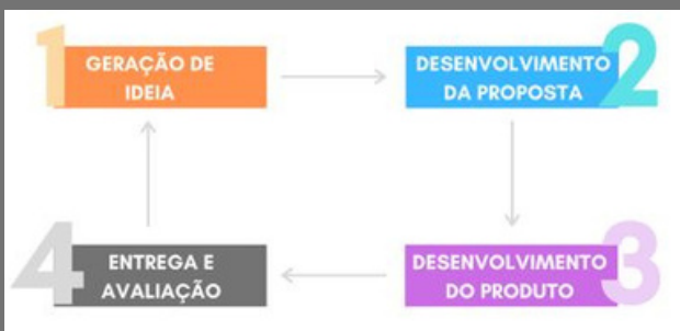
SCHEMATIC RESULT OF THE DESIGN PROCESS OF LABORATORY LUZ E CENA - LALUCE