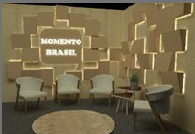
BRAZIL MOMENT SCENARIO CASE STUDY 01