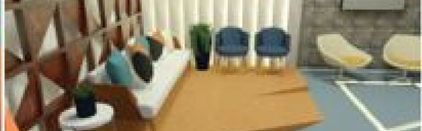
SCENARIO MODEL OF THE MUNDO UFG PROGRAM - PROOF WORK OF THE LALUCE DESIGN PROCESS