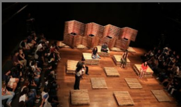
YOUNG CONNECTIONS PROGRAM SCENARIO CASE STUDY 02