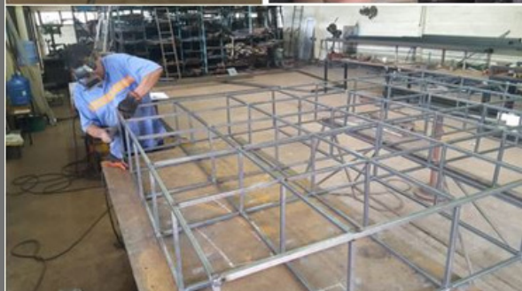
EXECUTION SCENARIO OF THE MUNDO UFG PROGRAM - PROOF OF THE LALUCE DESIGN PROCESS