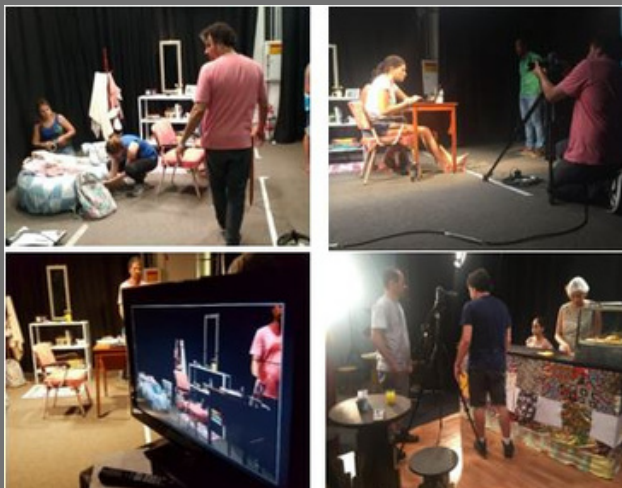
UFG STUDY PROGRAM SCENARIO CASE STUDY 04