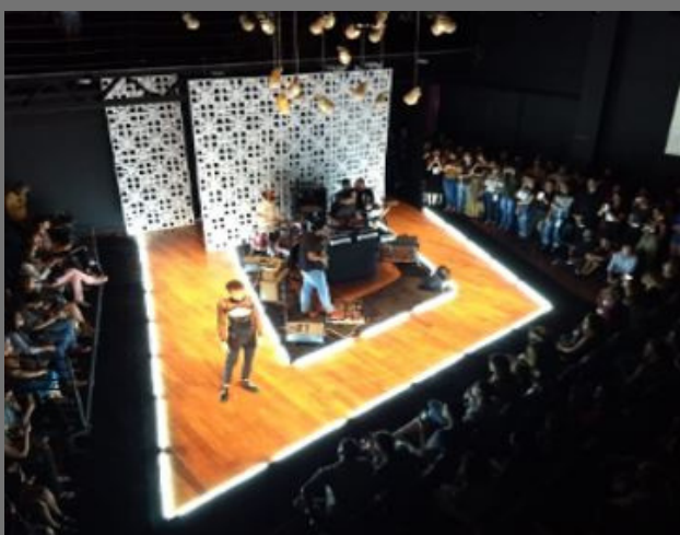
FAV FASHION SCENARIO CASE STUDY 05