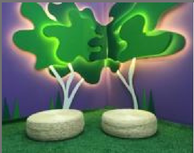
SCENARIO PROGRAM COCOON OF IDEA CASE STUDY 03